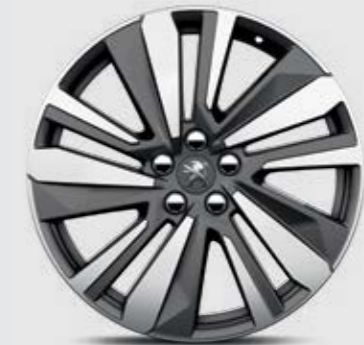
19" 'WASHINGTON' Two-tone diamond-cut alloy wheels