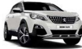
Pearl White (Pearlescent)