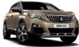
Pyrite Beige (Metallic)

Choose the colour that matches your character from the fourteen in our colour range.