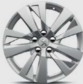
17" 'CHICAGO' alloy

Designed to complement the sharp exterior design, the new PEUGEOT 3008 SUV is available with a choice of alloy wheels in either painted or two-tone diamond-cut finishes.