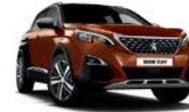
Sunset Copper/Nera Black (CF Metallic)

CF - Coupe Franche dual-colour paint design