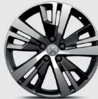
18" 'DETROIT' Two-tone diamond-cut alloy wheels