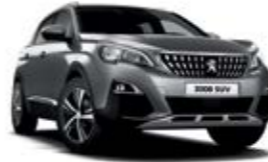
Artense Grey (Metallic)