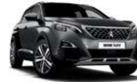
Nimbus Grey/Nera Black (CF Metallic)