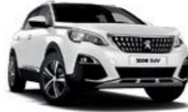
Bianca White (Matt)