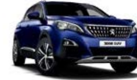
Magnetic Blue (Metallic)