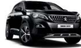
Perla Nera (Metallic)