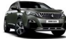
Smart Grey (Metallic)