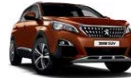
Sunset Copper (Metallic)