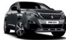
Platinum Grey (Metallic)