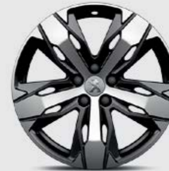
18" 'LOS ANGELES' Two-tone diamond-cut alloy wheels (linked to Advanced Grip Control®)