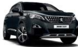
Hurricane Grey (Matt)