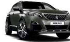
Amazonite Grey/Nera Black (CF Metallic)