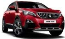
Ultimate Red (Special Metallic)